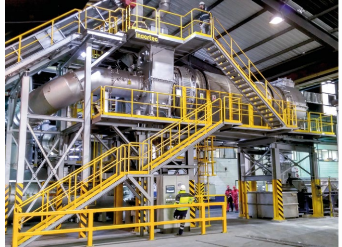
\ IDEX ® System for decoating process