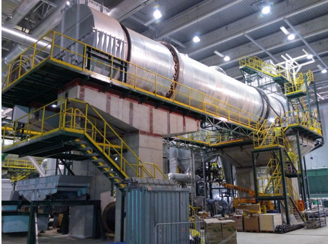
\ IDEX ® System for UBC decoating process