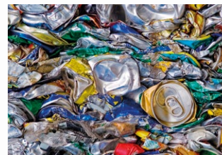
\ UBC before IDEX process