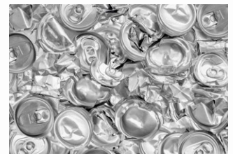
\ Decoated UBC after IDEX process