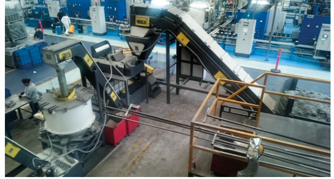
\ Chip Pretreatment - Crushing & centrifuge