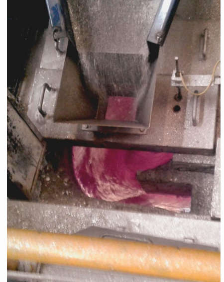
\ Chips dosing to the ALUSWIRLER®

The ALUSWIRLER® system is designed for continuous melting of aluminium chips, by submersion in a hot molten metal vortex.