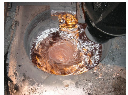
\ Molten metal vortex